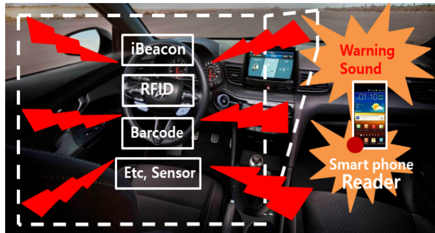
Fig. 4: Smartphone detection system in the driver's seat

States, about 10% of traffic accident deaths are caused by accidents caused by smartphone use and carelessness during driving and they are taking extraordinary measures because they are increasing by about 10% every year. In the United States, the driver's mode for preventing smartphone accidents is an unusual measure to prevent the smartphone's ability to communicate with the smartphone maker and car maker. It is said that it will be introduced by request.