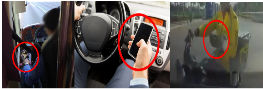
Fig. 2: Smombie driver case: a) Bus Smombie driver; b) Passenger car muddy driver and c) Motorcycle driver