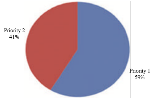
Fig. 2: Errors categorized by priority

With regard to the perceivable principle, TAW detects the omission of textual alternatives to non-textual contents ( f = 104 ) or the cases when their description is inadequate. The textual alternatives are fundamental for a person who interacts with the web using a screen reader. Pertaining to the operable principle, the error most often found is missing text in the links ( f = 279 ) which makes it easier for users to know where the links are and where they lead. As to the understandable principle, the most common error was encountered in form controls. Finally, results regarding the Robust principle are mostly due to source code errors which are detrimental to the interaction between the website content and assistive technology.