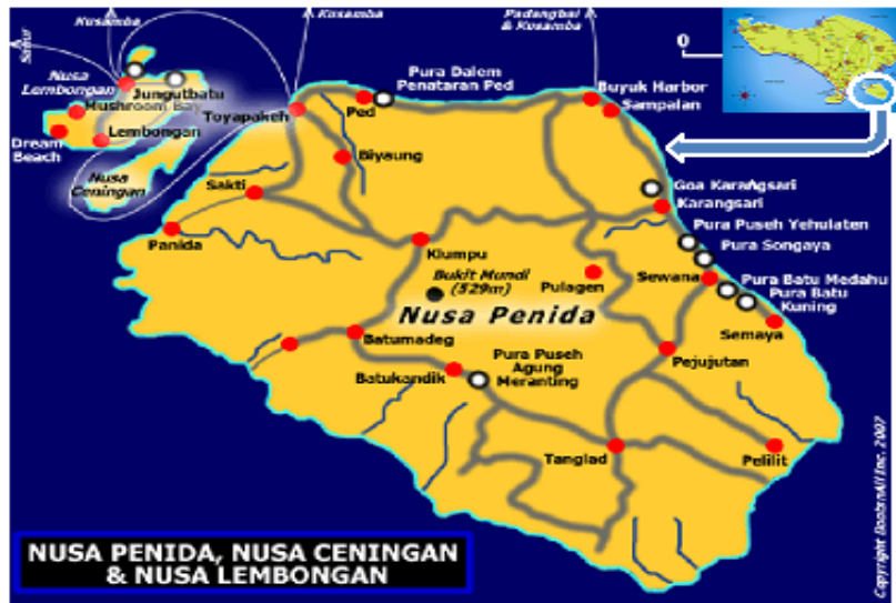
Fig. 1: Road network on Nusa Penida Island

process. To keep in mind this purpose, procedure to combine THK and benefit-cost analysis is developed as it is regulated by the standard on technical feasibility, financial and other social economy impact.