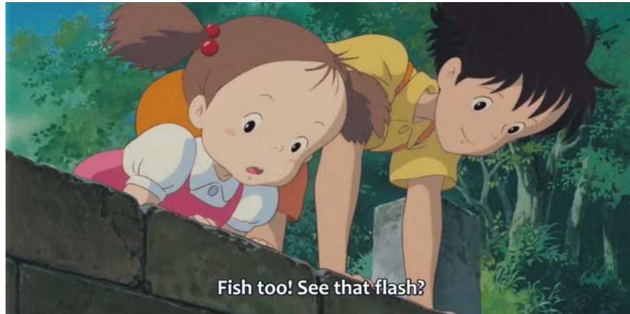
Fig. 7: The colour play important role to perceptive shot