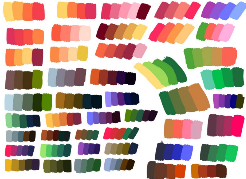
Fig. 2: Colour palette