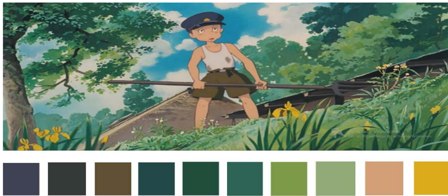
Fig. 14: Colour scheme