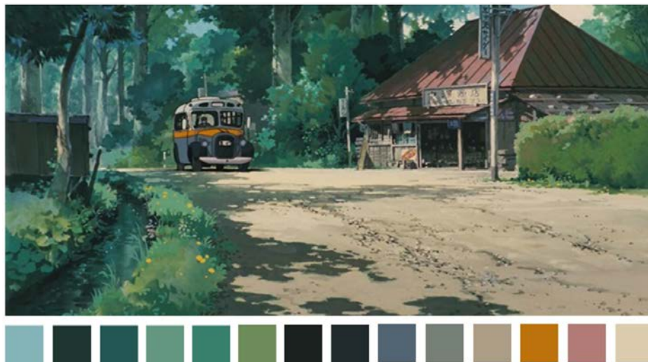
Fig. 15: Scene Kusakabe, Satsuki And Mei On the Way Goes to A New House