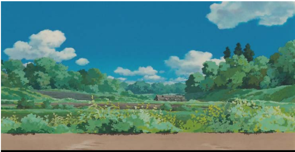
Fig. 3: Scene Sasuki and Mei come first house/neighbor

the scene those characters designs and so, forth throughout this way, observing and stock arrangement of all instrumentation (Moreno, 2014). 'My Neighbour Totoro' vivified arrangement need gave an alternate standard of e dutainment with perfect interactional utilizing different colour technique. In 'My Neighbour Totoro', Studio Ghibli using watercolour technique and others. For example, Fig. 3 using watercolour technique. Studio Ghibli famous with the art of background and technique colouring. Studio Ghibli using scheme colour like Fig. 4. Short anime such as 'My Neighbour Totoro',