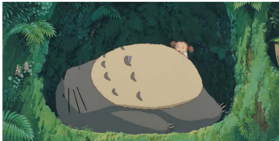
Fig. 8: Person specific scene highlights the vitality about convictions

spaces, the place the sky also clouds need space will inhale. Mei and Satsuki who need aid themselves skilled about finding enchantment for new air more acorns. Those first things these sisters discuss when they land at their new home are the fish in the close-by river and the charming tunnel about trees that acts such as a walk-way up to their house. They are consumed for way like Fig. 7.