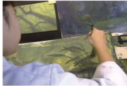
Fig. 1: A girl drawing a picture

Colour: Shades are rich with imagery. This imagery could be clear for how a singular co-partners shades for things, questions or physical space (NAZ et al. , 2009). Colour more light need aid acquainted with us from right on time childhood, they appear to be characteristic and we take them too allowed. A significant number colour inclination alternately colours acquaintanceships for diverse shades