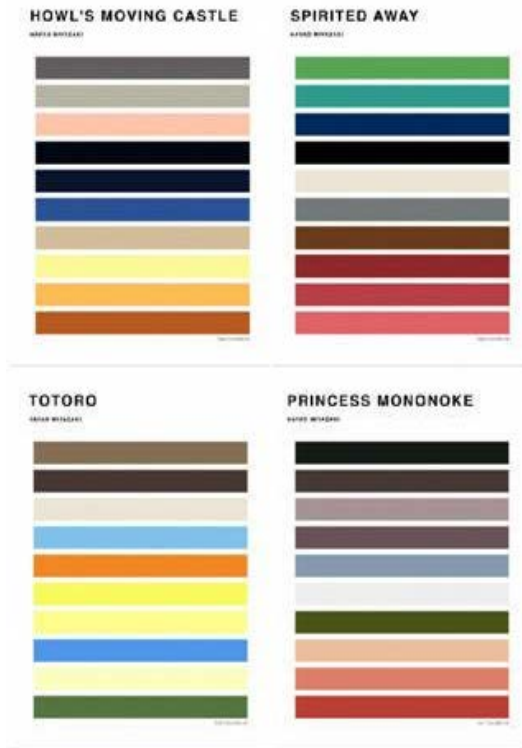
Fig. 4: Most colour palette in anime