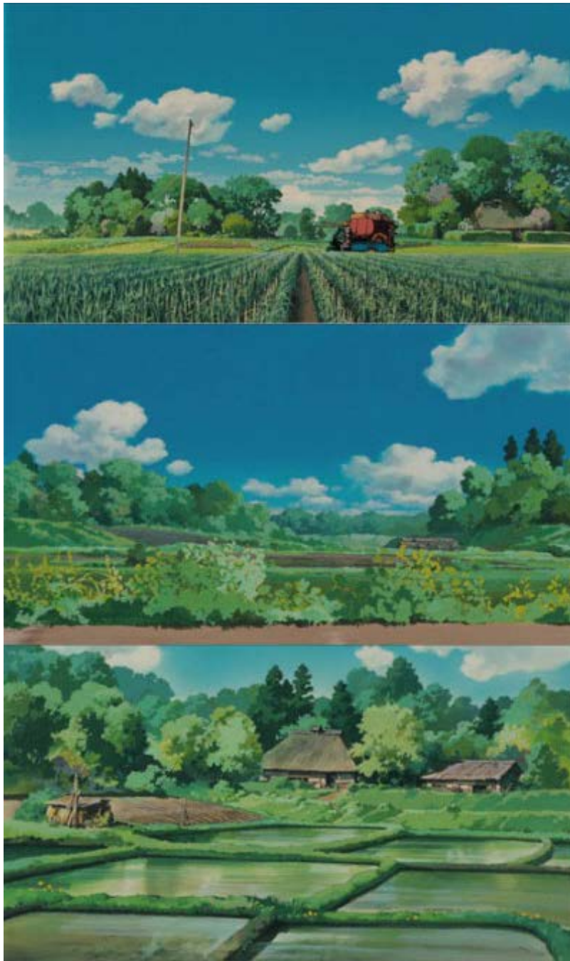
Fig. 6: 'My Neighbour Totoro' interesting visual colour of how character perspectives different

Anderson (2014) It's a novel into a film that has an inclination that adolescence there's generally no simpler path to set it. Mei (3) Furthermore Satsuki (10) about 'My Neighbour Totoro' are related toward those possibility of beginning another an aggregation in the country and need aid enthusiastic will splash in the delectable scene