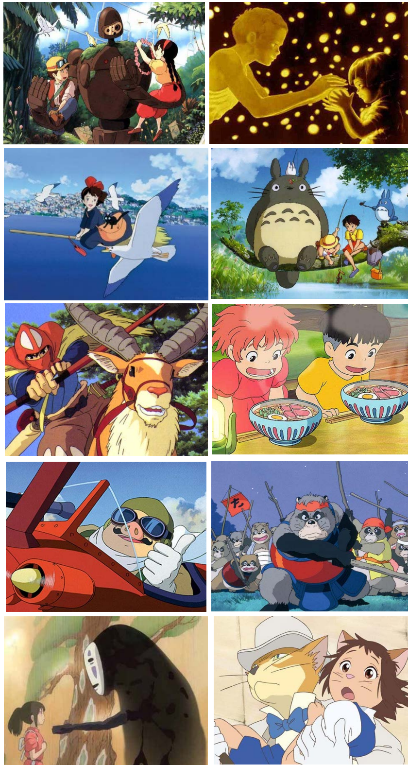
Fig. 5: List Short Anime by Studio Ghibli