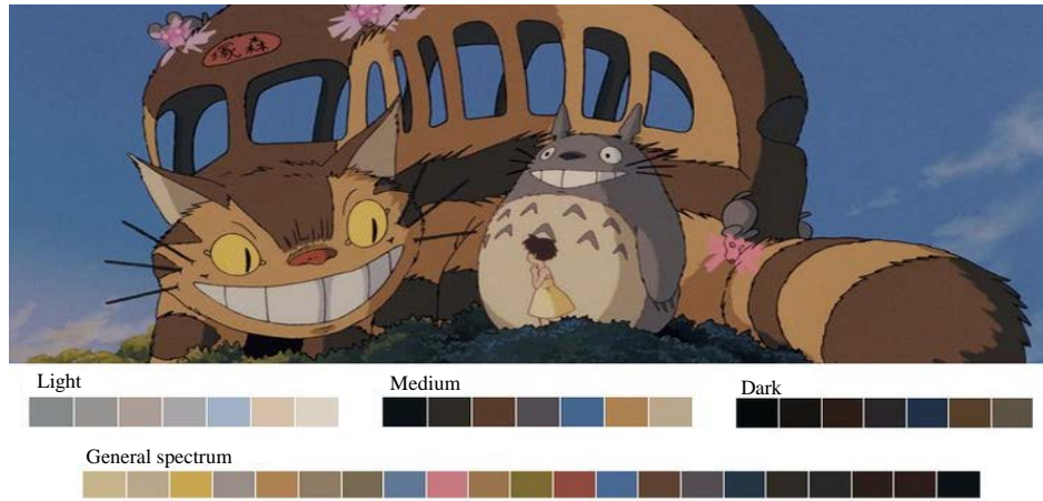
Fig. 13: Scheme colour for Totoro and Catbus