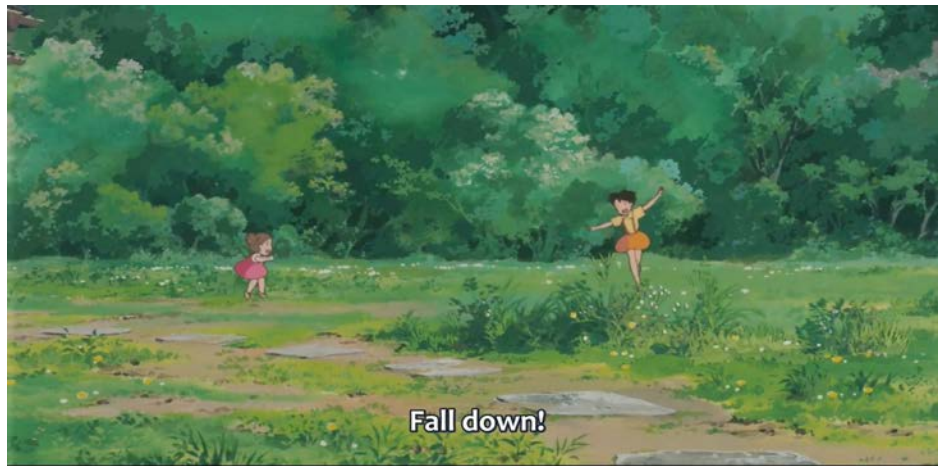
Fig. 9: Tone arm of the film is dreamy and playful