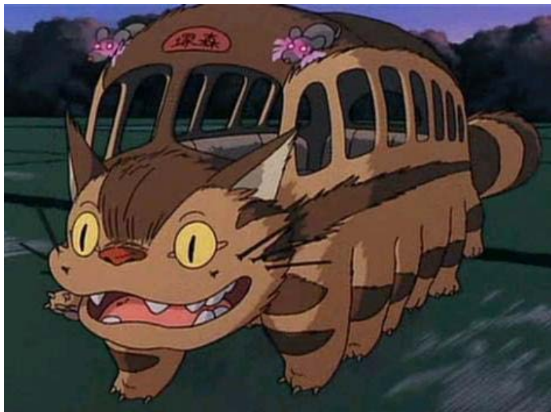
Fig. 10: The colour change to warm, golden, womb-like

need those sun-soaked shades furthermore, listless pace of a spring evening in the country but the manner it melds such components with an unpretentious treatment medicine of the children's tension over their mother makes it a radical novel into a film.