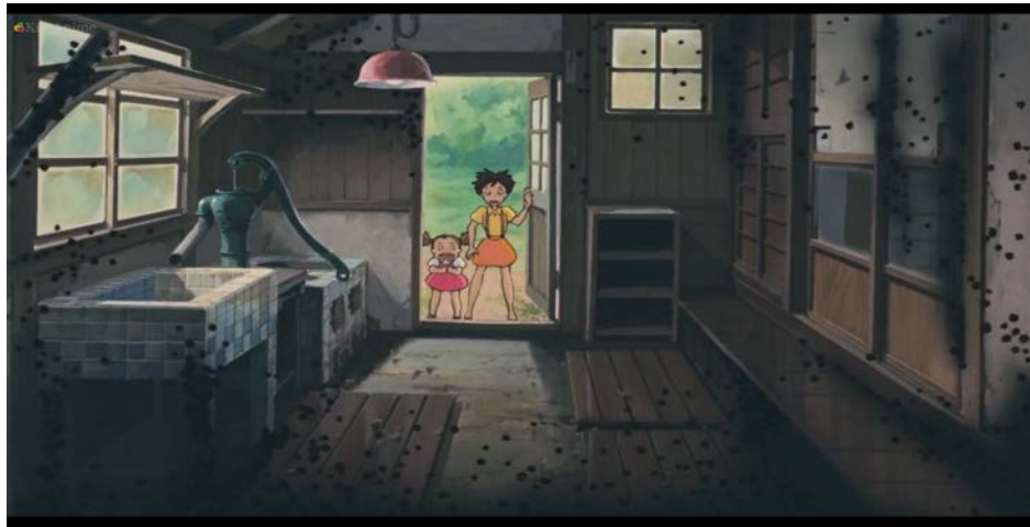
Fig. 11: Small, dark, dust-like house spirits seen when moving starting with light on dim spots