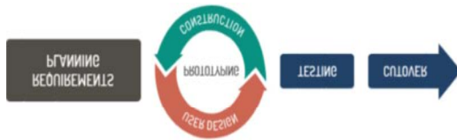
Fig. 1: Rapid application development methodology model