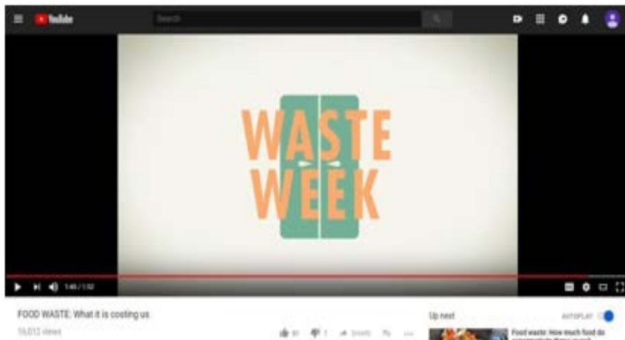
Fig. 3: About food waste