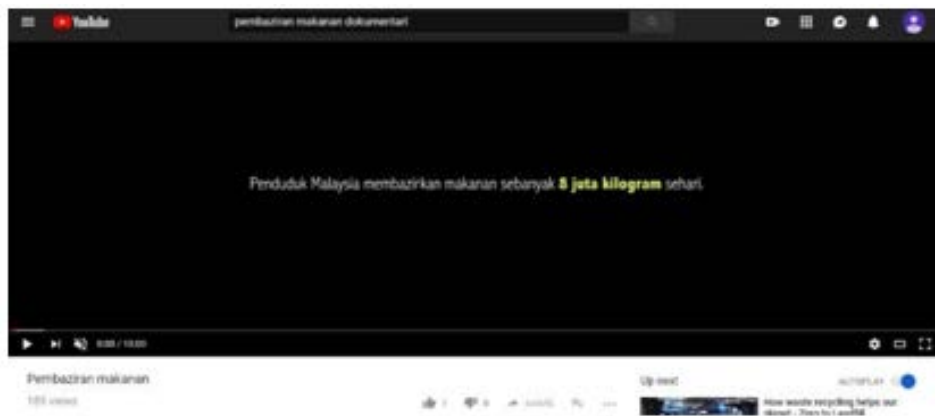
Fig. 6: Food waste situation