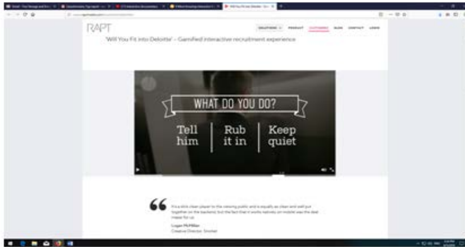
Fig. 5: Gamified interactive recruitment experience