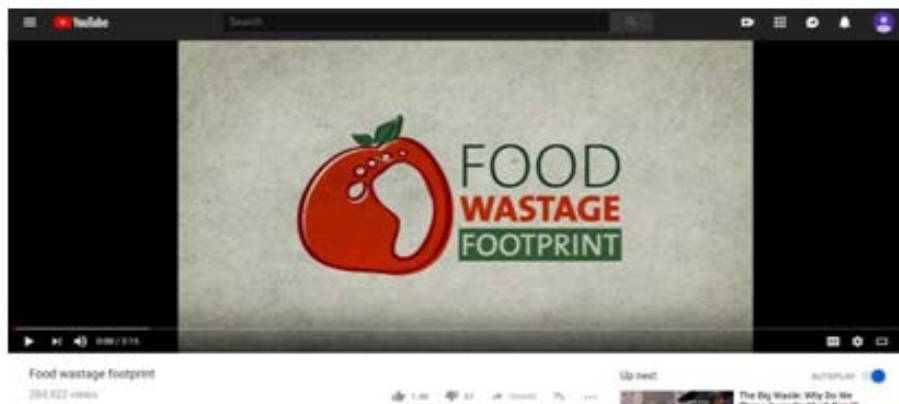
Fig. 4: Food wastage footprint