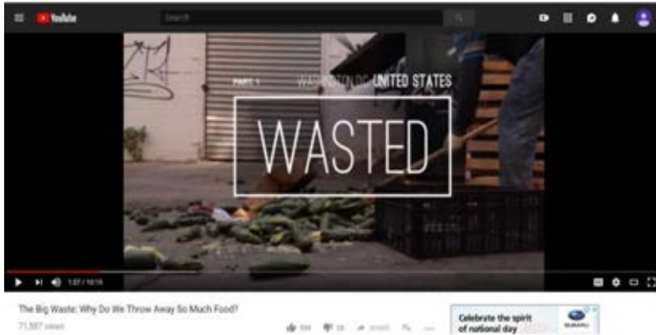
Fig. 2: Overview of documentary