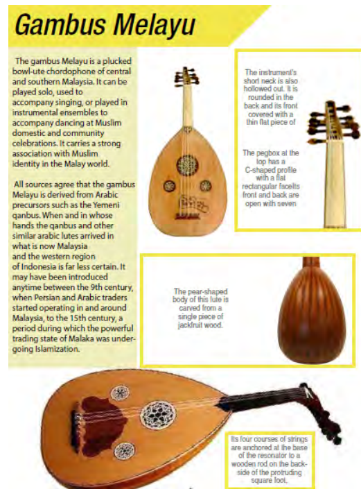
Fig. 3: An example of the book design

Development phase: All the content designed in the previous phase will be use in the development phase. The target image or marker has been imported to unity and