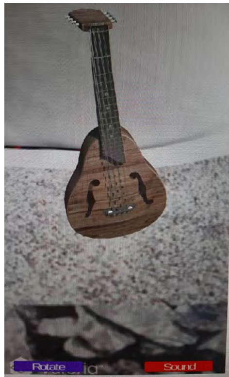
Fig. 4: An example of AR Graphic User Interface (GUI)