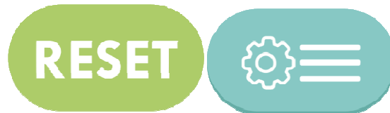
Fig. 4: The button design

that age. The main concept for this interactive magazine is learn through play. So, the design must be the same as the concept.