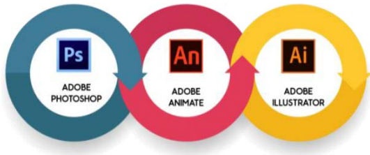
Fig. 2: Software to develop this application

the analysis and the design phase. That mean, if we did these phases correctly the development will be easier. In this phase also the backup plan is very important. So, in this phase I will use a few software to build the output. As you can see in Fig. 2 that software I will use.