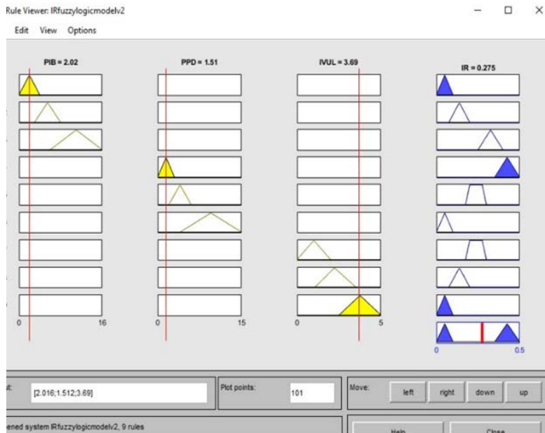
Fig. 3: The conditions of adaptability to diffuse pollutants

in the study area is just above an average state which means that the conditions of adaptability to diffuse pollutants are moderately sustainable and that clear policies should be defined that enable better anthropic practices that tend to reduce the level of impact, ensuring better health conditions throughout the area (Fig. 3).