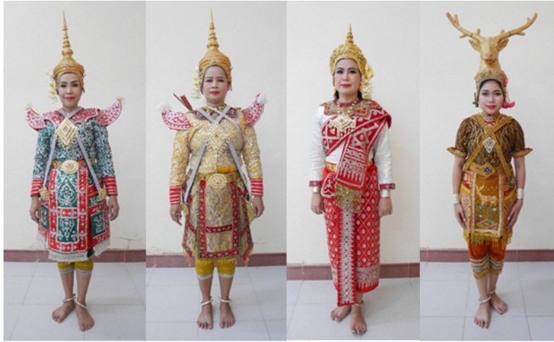
Fig. 5: Costume of Phra Ram, PhraRak, Sita and Kwang Thong (Golden Deer) in the Fon Phra Rak Phra Ram, Thanurit Episode

Performance music: Using the Phin Phat or Pi Phat orchestra which consists of ranadek (xylophone), ranadthum, khongwong, Thai tympani, taphon, tambourines, flutes, ching (Thai cymbals), chab (cymbals) (Fig. 5).