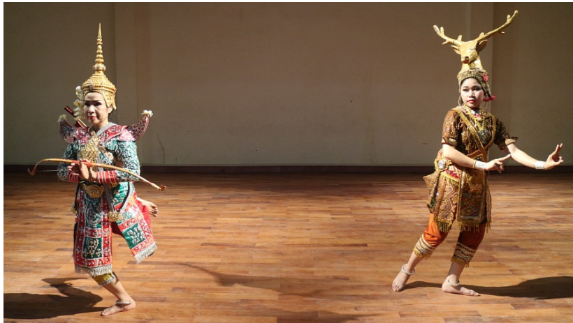
Fig. 4: Dance style of Phra Ram and Kwang Thong (Golden Deer) in the Fon Phra Rak Phra Ram performance, Thanurit episode

Music for Khon performance: Preferably the five-pieced Pi Phat orchestra; including Ranadek (xylophone), Khongwongyai, Taphon, Thai tympani, Bass oboe and Ching (Thai cymbals).