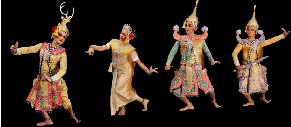
Fig. 2: The dance style of Kwang Thong (Golden Deer), Sita, Rama, Lakshmana in Khon Ramayana dance: ‘Rama follows the deer’ episode

represent the monkey’s hair. The story was narrated by giving a preface telling the story with a melody which was called a story narration and dialogue narration with melody in the style of KapYanee and Kap Chabang by a voice actor called narrator and dialogue narrator who give the intro, accompanied by chorus singing with the music from a five-typed Pi Phat orchestra. The performed stories are Ramayana and Unnarut.