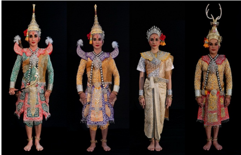
Fig. 3: Costume identities of Rama, Lakshmana, Sita and Kwang Thong in Khon Ramayana dance: 'Rama Follows the deer' episode