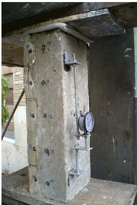
Fig. 4: Prism typed built with regular thickness of stone units (with 200×150 mm cross section) after failure