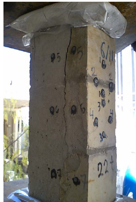
Fig. 6: Prism type b built with irregular thickness of stone units (with 100×150 mm cross section) after failure