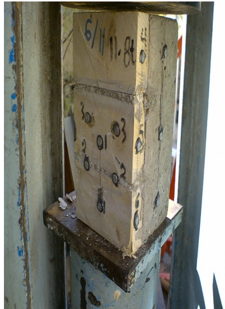
Fig. 9: Prism type b built with regular thickness of stone units (with 100×100 mm cross section and stone thickness of 25 mm) after failure