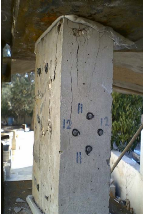
Fig. 7: Prism type b built with irregular thickness of stone units (with 100×150 mm cross section) after failure