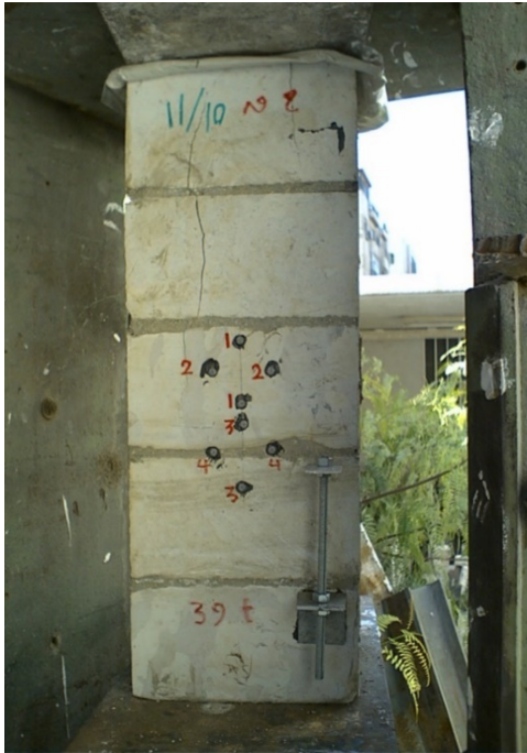
Fig. 3: Prism type d built with irregular thickness of stone units (with 200×150 mm cross section) after failure