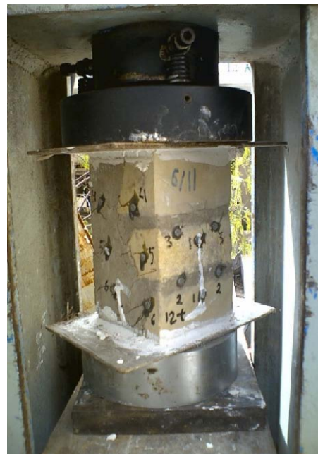
Fig. 10: Prism type b built with irregular thickness of stone units (with 100×100 mm cross section) after failure