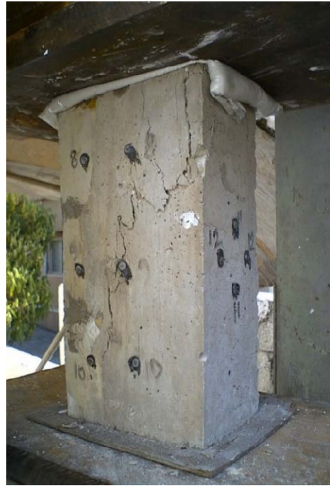
Fig. 5: Prism type b built with irregular thickness of stone units (with 100×150 mm cross section) after failure