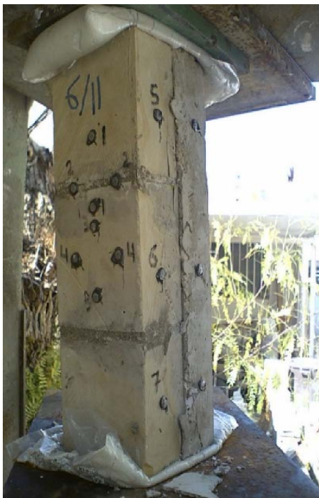
Fig. 8: Prism type b built with regular thickness of stone units (with 100×100 mm cross section) after failure