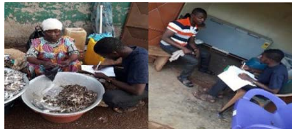
Fig. 2: Primary data collection