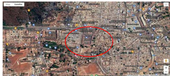
Fig. 1: Map of Aboabo Market, Tamale

Analysis: The data collected was inputted in MS Excel 2016 and exported to SPSS version 20.0 for descriptive