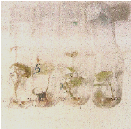
Fig. 3: Callused tissues obtained at concentration of BAP 0 + NAA (1.0) mg L -1

Means with the same letter(s) down the column are not significantly different