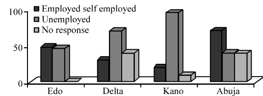
Fig. 3: Occupations of victims of trafficking in some states and the federal capital territory of Nigeria, UNAFRI (2007)