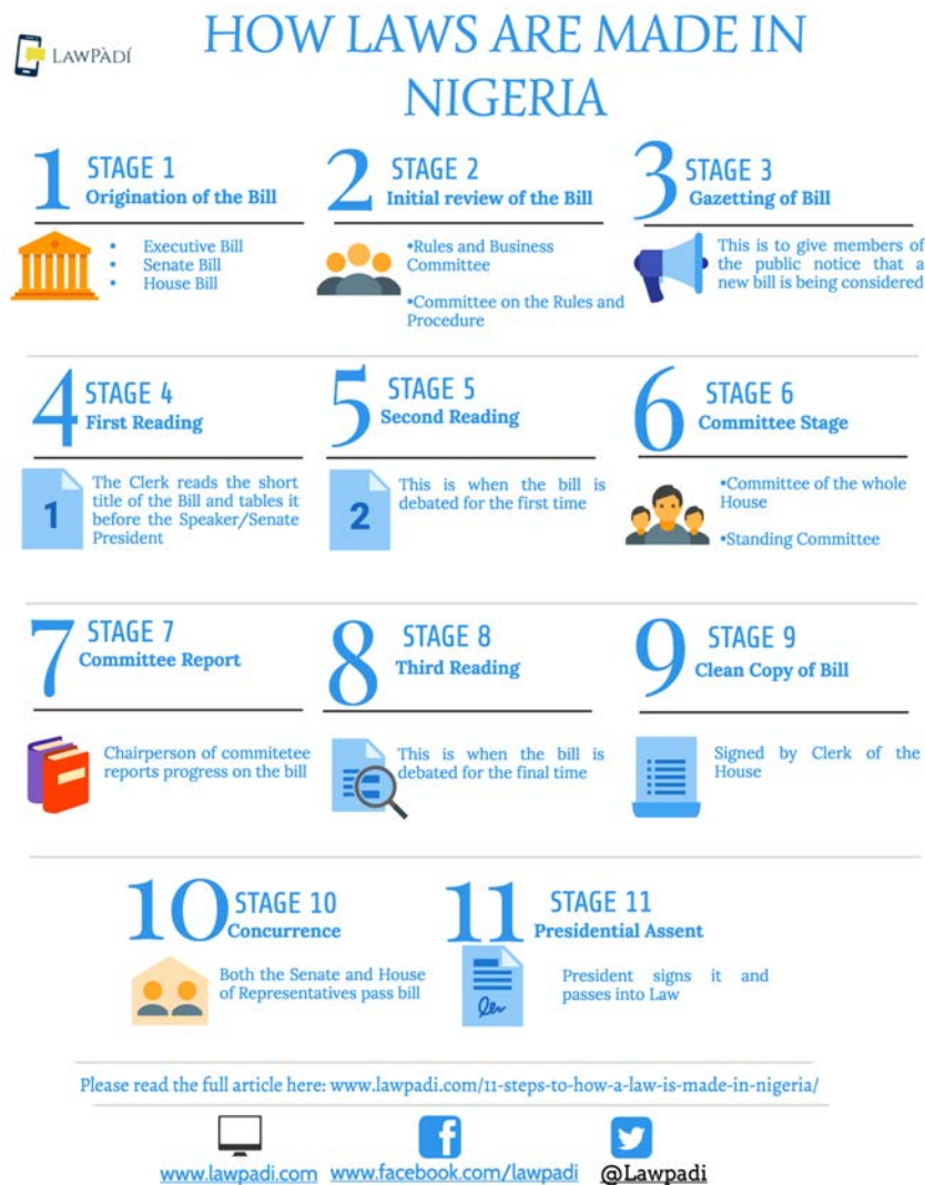
Fig. 2: Nigeria legislative making template