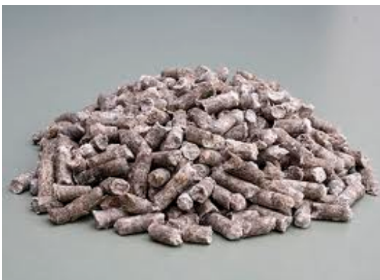
Fig. 2: Photo stabilizing additive

Differences in grain composition of the mineral material, the amount of binder and indicators of physical and mechanical properties governed by the requirements of different countries, due to different climatic conditions, differences in maximum permissible load on the axle vehicles and viscosity of the binder used. Normalize