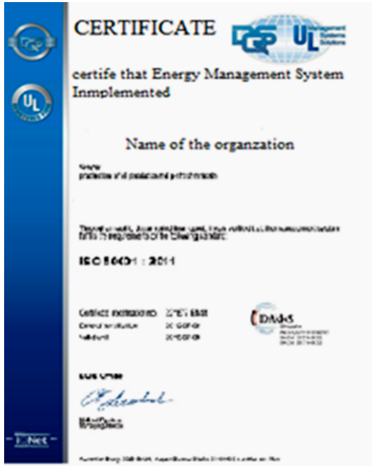
Fig. 2: Certificate of the ISO 50001:2011 implementation