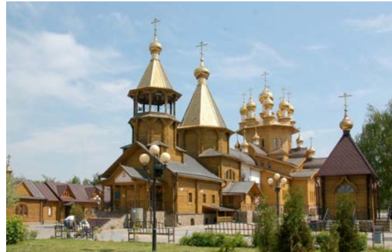
Fig. 1: Wooden multifunctional church of St. George the Victorious

Temples could be erected with a belfry and refectory or without them but for all variations of temples