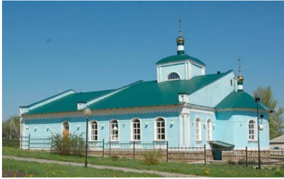
Fig. 5: Pokrovsky Cathedral in the village of Podolhi in Prokhorovka area