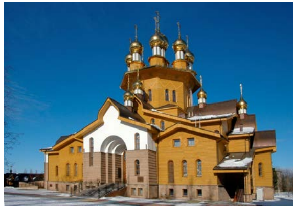
Fig. 2: Wooden multifunctional temple of the Holy Martyrs Faith, Hope, Charity and their mother Sophia in Belgorod

space-planning composition the main volume has always been the quadrangular temple dome, completed with light drum and crowned with bulbous head with a cross. In architectural decoration of concrete panels wall protections reliefs were applied. They are traditional for Russian stone architecture the arched niches and ogee framing of the windows and doorways, pilasters and bands, that divide walls in curtain walls to give the harmony to facade, drawn rustications and multifunctional cornices and multi attic little walls finishing facades of temples quadrangles erected without the refectory and bell tower. Small insertion of face brick or bell tower, constructed entirely of brick complement a variety of architectural solutions. The 14 temples all in all were built of precast reinforced constructions. Twelve of them are multifunctional temples which combine the liturgical functions (ground floor), cultural, educational and economic-office (in the basement). These temples were in demand in many parts of the Belgorod region: Temple of the Icon of Mother of God "Sign" in the village