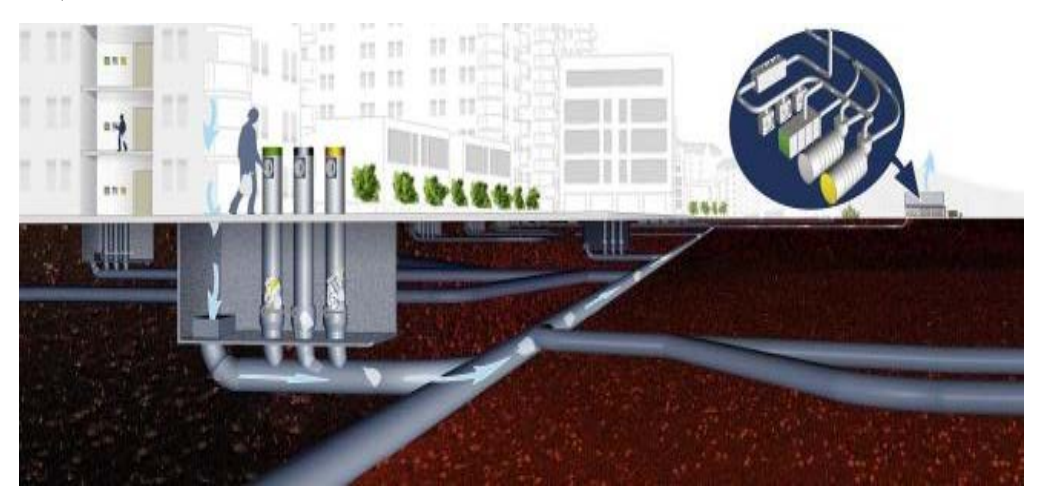
Fig. 13: The scheme of vacuum waste disposal, characteristic for Sweden and Finland

Fig. 12:a) Placement of the industry; b) the scheme of waste disposal in ecovillage (Blagovidova and Mikulina, 2014a, b)