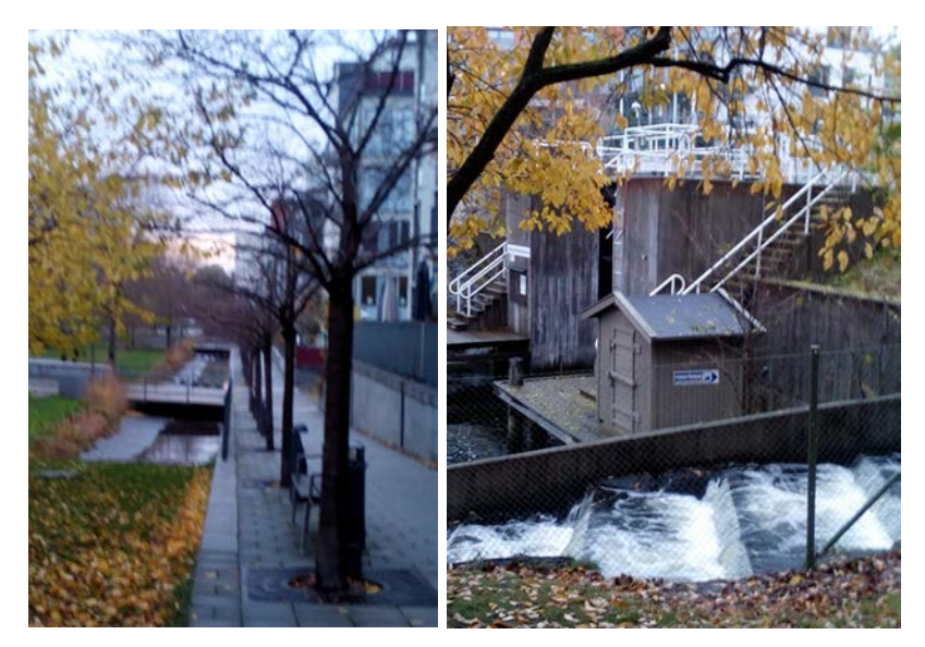
Fig. 14: Ecovillage Hammarby (Perkova, 2015a, b)