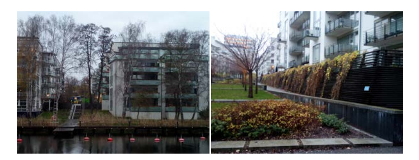
Fig. 7: Quarter building ecovillage Hammarby (Perkova, 2015a, b)

Fig. 6: The scheme foot and cycle paths in the settlement (Blagovidova and Mikulina, 2014a, b)