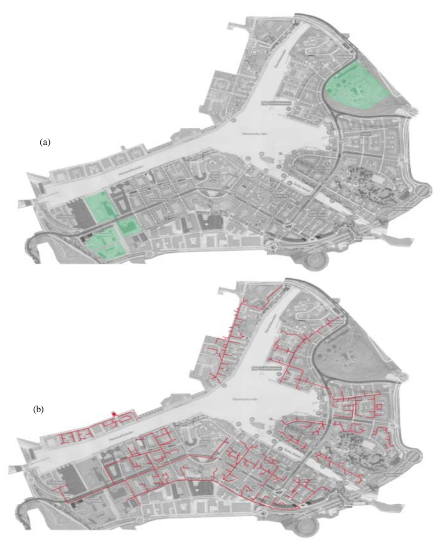
Fig. 12:a) Placement of the industry; b) the scheme of waste disposal in ecovillage (Blagovidova and Mikulina, 2014a, b)