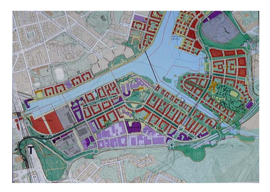
Fig. 2: The general plan of Hammarby. Company presentation IVL in Stockholm (Perkova, 2015a, b)

Fig. 1: The region of Hammarby in Stockholm (Sweden): last, real, future. Company presentation IVL in Stockholm; industrial area size since late 1800