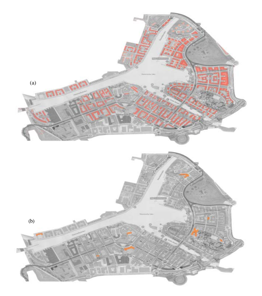
Fig. 10: Quarter housing development: a) Educational institutions; b) In the settlement of Hammarby (Blagovidova and Mikulina, 2014a, b)

Fig. 9: Various solutions of facades with use of contrast colors, invoices, materials, various drawings of windows and forms of balconies ecovillage Hammarby (Perkova, 2015a, b)