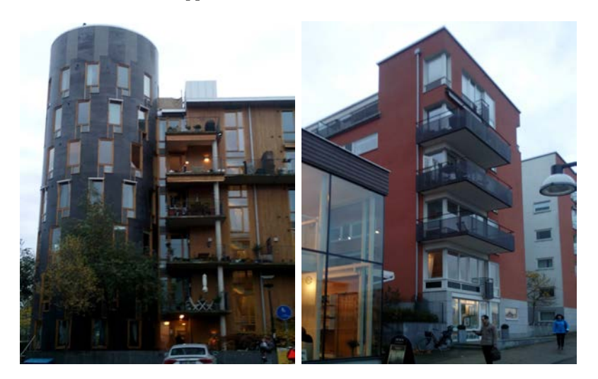
Fig. 9: Various solutions of facades with use of contrast colors, invoices, materials, various drawings of windows and forms of balconies ecovillage Hammarby (Perkova, 2015a, b)