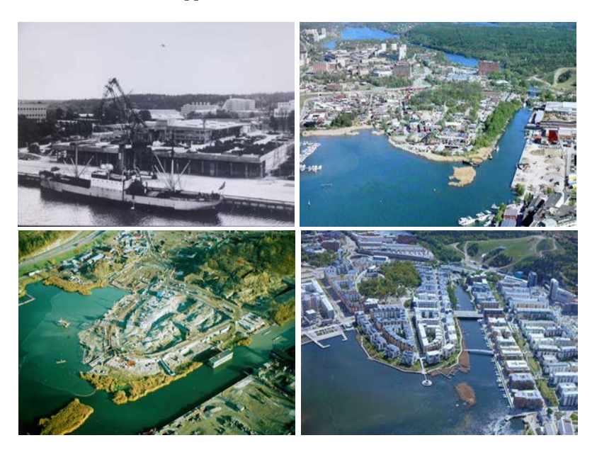
Fig. 1: The region of Hammarby in Stockholm (Sweden): last, real, future. Company presentation IVL in Stockholm; industrial area size since late 1800