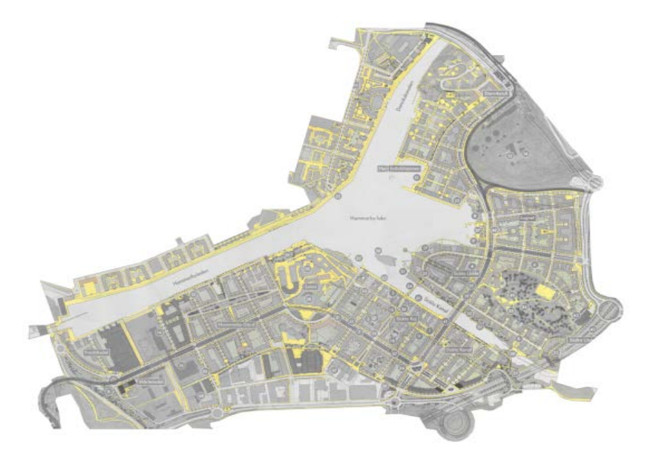
Fig. 6: The scheme foot and cycle paths in the settlement (Blagovidova and Mikulina, 2014a, b)