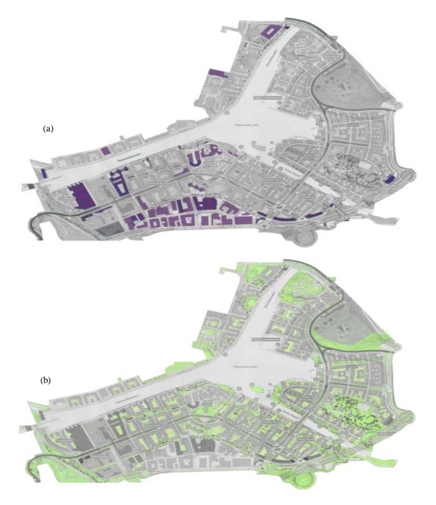
Fig. 11: The placement of the offices in the structure of the ecovillage (at the left) and green areas (Blagovidova and Mikulina, 2014a, b)

When planning the area provided for the establishment of a large number of well-planned public spaces in quarters, parks on embankments was provided. The special nature of the formed public spaces gives the mentality of the Swedes. Interpenetration of an interior and exterior their "merger" due to lack of elements of a decor at windows characterizes a single, accessible open and safe environment of the settlement. Lighting of streets with the help not only external but also internal lighting can be considered also as an important element of control over public spaces. Offices in the bulk are concentrated on perimeter of a housing estate from South side of an ecovillages. In Hammarby created the special information center devoted both the theme of the functioning of the district and the general aspects of steady architecture. In conference rooms of scientific center pass public meetings and discussions of the vital issues of functioning of the city. They are also used as