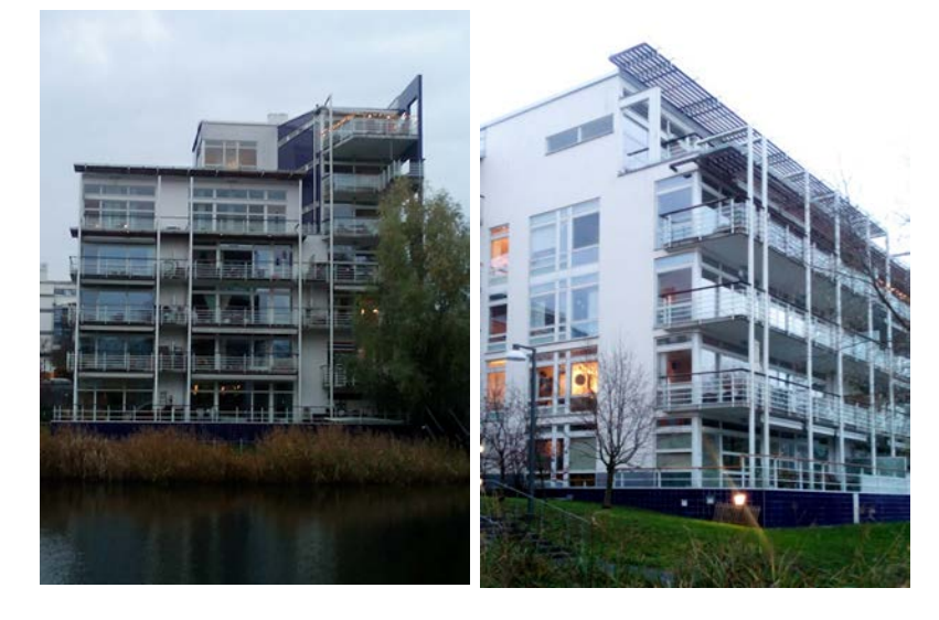
Fig. 8: The architectural appearance of buildings ecovillage Hammarby (Perkova, 2015a, b)