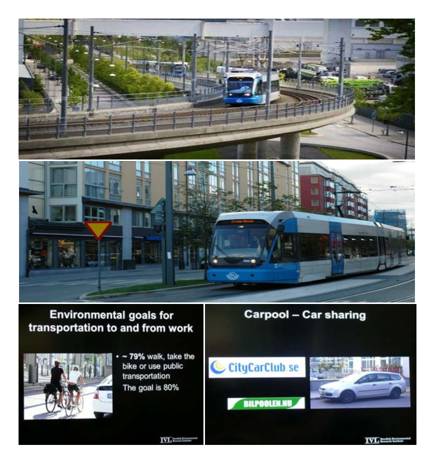
Fig. 4: Modes of transport, connecting Hammarby with other parts of the city. Presentation of the IVL company in Stockholm (Perkova, 2015a, b)