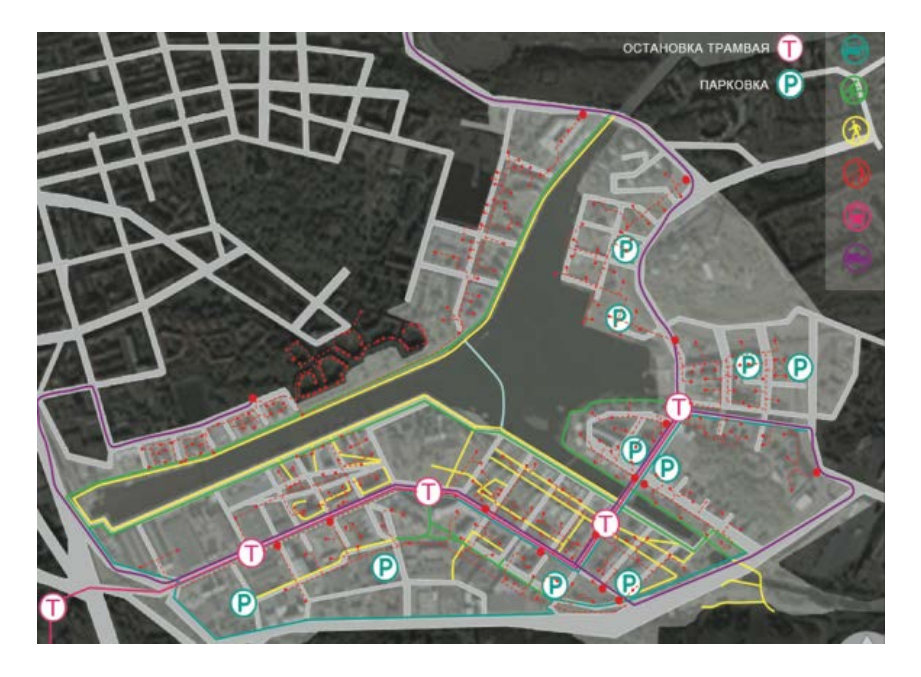
Fig. 5: The scheme of a transport and pedestrian network in Hammarby (Blagovidova and Mikulina, 2014a, b)

Fig. 4: Modes of transport, connecting Hammarby with other parts of the city. Presentation of the IVL company in Stockholm (Perkova, 2015a, b)