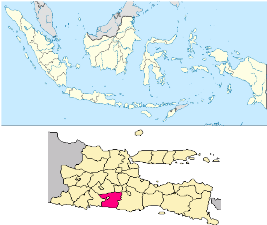
Fig. 1: Location of study

Ferro-cement is as a variant material of reinforced concrete but the thickness is only about 10-40 mm. Ferro-cement as a reinforcement is used as wiremesh. So far the wiremesh has been as the main option on ferro-cement. In implementation, the using of channel lining with ferro-cement is cheaper and more economic