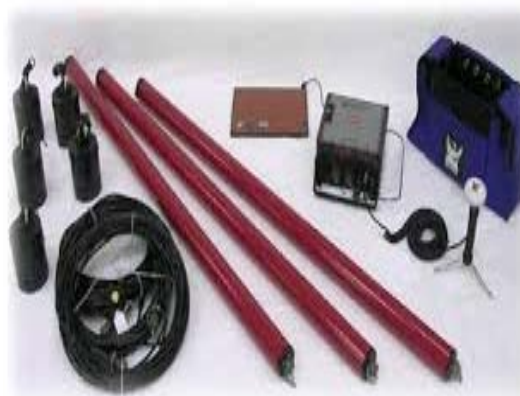
Fig. 2: Magnetotelluric electromagnetic soundings; http://en.openet.org/wiki/Magnetotellurics