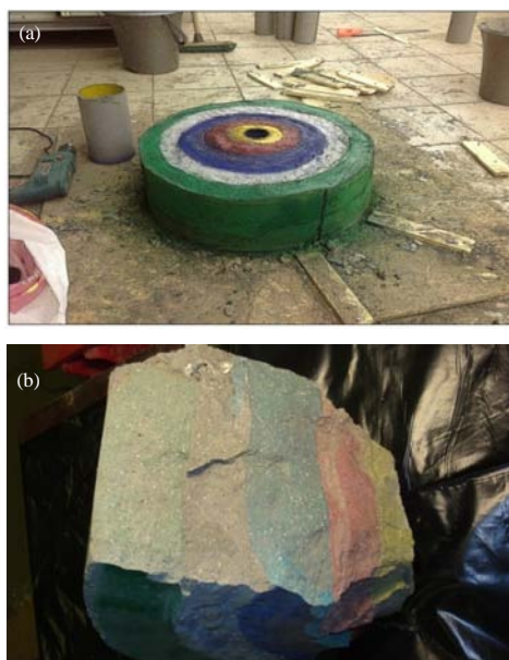
Fig. 1: a) External model view and b) Internal model structure

To prove numeric calculations model experiments were carried out on cylindrical blocks. When realizing a model of zone blasting a removable frame of hollow thin-wall cylindrical forms of different diameter was created. The total amount of cylinders is 6 pieces. Cylinder radius ranges from 10-100 relative charge radii ( \bar{r} ). The height of all cylinders is 80 relative radii. You can see constructional parameters and model view illustration in Fig. 1.