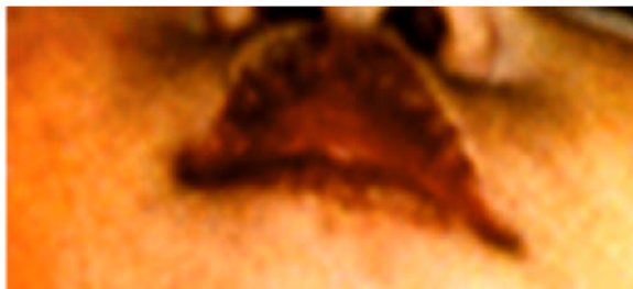
Fig. 1: A diagnostic image showing coronary and cardiac pathology