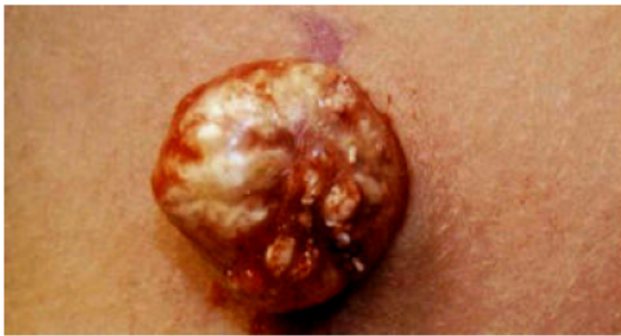
Fig. 3: The most common lesions color was cream