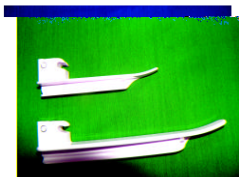
Fig. 2: Topster disposable laryngoscope

most of the glottis seen, only the posterior extremity of the glottis seen, no part of the glottis seen and neither the glottis nor epiglottis seen (Fig. 1). The brightness during laryngoscopy was also assessed using a visual analogue scale (VAS). The scale, a 10 cm line, was used for this purpose, with the word 'darkest' on the left side of the line and 'brightest' on the right side. Duration of tracheal intubation was described as the time from entering the laryngoscope into the oral cavity until passage of tracheal tube via the vocal cords. Self-reported anesthesiologist satisfaction was also described as favorable, acceptable and bad. Success of intubation was confirmed by capnograph and auscultation of symmetric bilateral ventilation. If arterial oxygen saturation was decreased below 85%, laryngoscopy was terminated and after enough oxygenation of patient, laryngoscopy was repeated. In addition, any problem associated with the use of the laryngoscope such as damage to the blade or loss of light during laryngoscopy was recorded (Fig. 2).