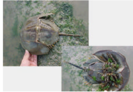
Fig. 1: Marine animal horseshoe crab

Turbidity assay: To carry out the turbidity assay, 20 mL of marine biolysate put in a 20 mL pre-prepared anticoagulant reagent (3% NaCl + 0.125% NEM + 150 \mu L absolute alcohol) which contain in an autoclaved flask. The process was proceeded the same preparation of isolates as mentioned above using suspension containing different number of bacteria colonies per mL. After the