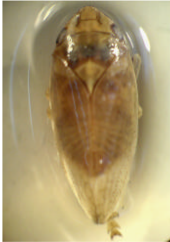
Fig. 1: Philaenus spumarius (L.) adult under \times 6.4 magnification