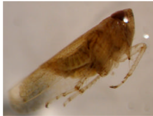
Fig. 4: Third nymph instar of second generation under \times 10 magnification

Study of old nymph instar showed that they move to upper part of plant, 3rd nymph to 20-30 cm height, 5th nymph to nearly 50 cm height on plant. All of the nymphs are spittle producer except adult which doesn't produce spittle. Nymph activity on plant gradually increases and 5th nymph is last presence of spittlebug inside of the foam.