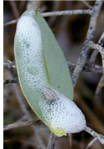
Fig. 3: Nymph activity of first generation through the froth on camel thorn plant