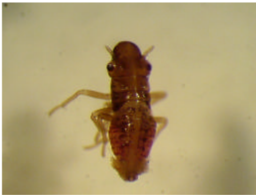
Fig. 2: Second instar of the first generation under \times 40 magnification