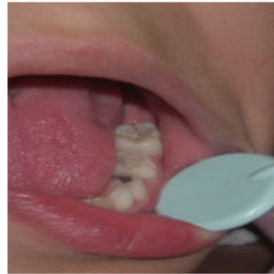
Fig. 1: Moderate ankylosis in lower primary molars

Other observed anomalies in ankylosed group included: hypoplastic defects on central incisors, macrodontia of upper incisors, ectopic eruption of upper canines. Follow-up during the next two years revealed spontaneous mobility or exfoliation in 98% of first primary molars. The significant variables were Ectopically erupted canines p < 0.001 OR = 5.78 (95% CI 2.1-15/86), Hypoplastic defects on enamel (Table 2). Among 23 ectopically erupted canines in ankylosed group 16 were unilaterally.