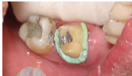
Fig. 3: Use of expasyl paste for gingival retraction

(Fig. 4). For the fabrication of provisional restorations a poly (methylmetacrylate) acrylic resin (Duraly, Reliance, Worth, Illinois, USA) city, state?) was used. The provisionals were indirectly made on a yellow stone casts made from an irreversible hydrocolloid impression. The acrylic resin restorations were adjusted and then polished with pumice slurry and high-shine acryluster material on a 4" rag wheel. The provisional restorations were cemented with zinc oxide eugenol temporary cement (Temp-Bond, Kerr, S.P.A, Italia).