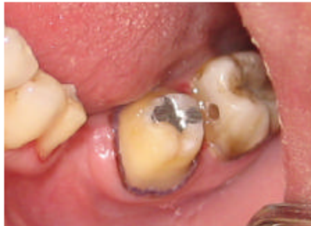
Fig. 2: Use of saturated gingival cord with aluminum chloride