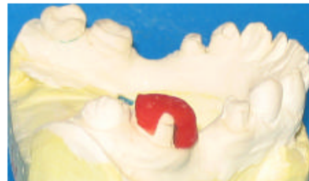
Fig. 5: Distance from original mark to the crest of the gingiva determined with a jig

determined with an acrylic resin (Pattern resin; GC, America Inc, Alsip, IL) jig (Fig 5). The Jig was well-adapted with the prepared teeth on all 4 casts. Both Plaque index (Laufer et al. , 1997) (Silness and Loe) and gingival inflammation, were assessed at the same visit session.