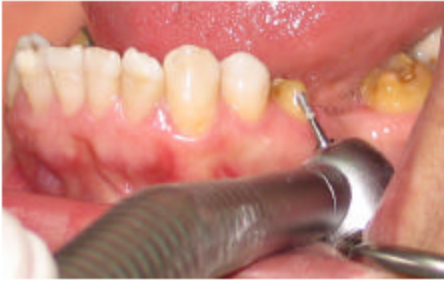
Fig. 1: Marked teeth in middle third of buccal surface