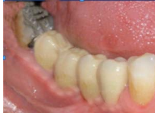
Fig. 4: Final restoration after 12 months