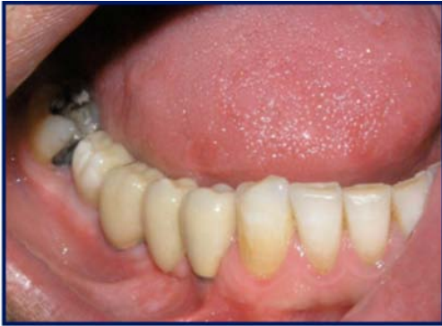
Fig. 3: Final restoration