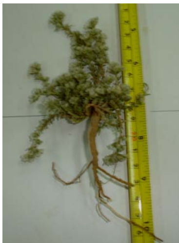
Fig. 1: Paronychia kurdica species

Sampling from area studying plants after sending to laboratories. Each plant was photographed to record general above-ground and below ground morphology/architecture prior to being dissected into its component parts to determine biomass. Above ground biomass was measured by separating the foliage, branches and stem. Each component was oven dried at 80°C for 24 h then weighed. Below ground biomass was determined by hosing roots clean of soil before, they were oven dried at 80°C for 24 h then weighed. The dry weight of each plant component was recorded to the nearest 0.1 g and statistical analysis is done by Excel.