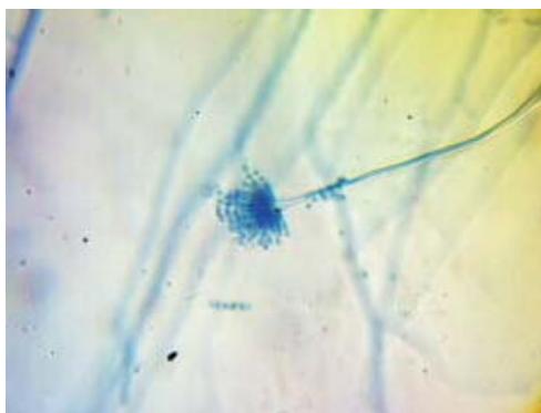
Fig. 4: Microscopic morphology of isolate SB