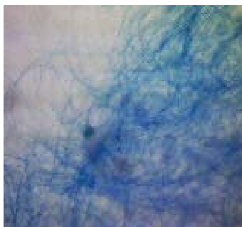
Fig. 3: Microscopic view of stained fungal hyphae colonizing the LDPE film