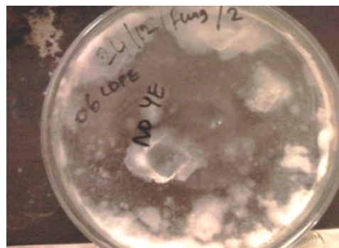
Fig. 2: LDPE film showing colonization of hyphae

Table 2 shows the value for CO 2 evolution from the degradation of LDPE sample by the fungal isolates. The isolate SD was found to evolve about 4 g L -1 of CO 2 in 1 week and isolate SB evolved around 3.8 g L L -1 of CO 2 . From the slide culture technique based on the microscopic morphology, we identified the isolate, SB as Aspergillus versicolor and SD as Aspergillus sp. (Fig. 4 and 5). The list of pollutants which pose environmental and health hazard and are tough for bio-degradation is a long one and includes solvents, wood preservative chemicals, pesticides, synthetic fibres, plastics, polyethylene, etc.