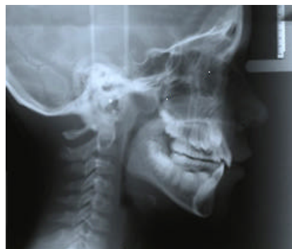
Fig. 1: Cephalometric radiograph