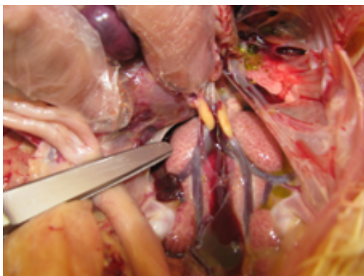
Fig. 1: Urates deposition and kidney lobules necrosis in broiler bird affected by gout (treatment group)

*Two different letters in a column show meaningful statistical difference between two groups (p<0.05)