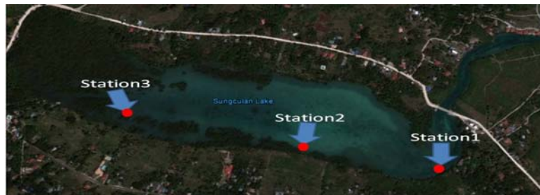
Fig. 1: Songculan Lagoon

The most dominant at the entire sampling site were the nematodes as shown in Table 1 and Fig. 2. Table 1 showed the relative abundance or dominant of meiofaunal taxa found among sediments in Songculan Lagoon, namely; Nematoda (34%, 552 individuals), copepod (17%, 282 individuals), Ostracod (16%, 258 individuals), turbellaria (15%, 241 individuals), gastropod (11%, 182 individuals), flatworms (2%, 40 individuals), gastroticha (1%, 22 individuals), polychaeta (1%, 21 individuals),