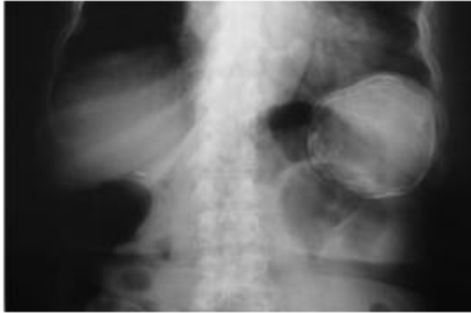
Fig. 1: Plain x-ray of the abdomen revealing a well-defined rounded soft-tissue opacity with calcified margins in the left hypochondrium