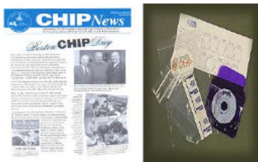
Fig. 3: Child identification program. The Purple Pack-Chip's kit 21, 22, 24 ( http://www.bellaonline.com )

of The Missing Child Centre of Hawaii processed Free Child Identification Kits. Volunteers weighed, measured, photographed, fingerprinted and completed an optional dental chart of children up to age 18 in order to record individual data and allow parents to use them in the future in an emergency (Lingle, 2005). Furthermore, the American Academy of Paediatric Dentistry (AAPD, 2007b) supporting the role that dental records play in forensic identification, encourages dental practitioners and administrators of child identification programs to implement simple practices that can aid in identification of unknown infants, children and adolescents. The AAPD recommends that parents establish a dental home where clinical data is gathered, stored and updated routinely and can be made available to assist in identification of missing and/or abducted child (Adams, 2003). A dental home should be established for every child by 12 months of age by the American Academy of Paediatric Dentistry (AAPD, 2007a). Moreover, the AAPD (2007a) encourages community identification programs to include a dental component documenting the child's dental home and encouraging consistent dental visits. Child Identification Program (CHIP) had been sponsored by the Freemasons (Fig. 3). This program gathered saliva samples for DNA fingerprinting, videos, toothprints and fingerprints ( http://www.mychip.org ).