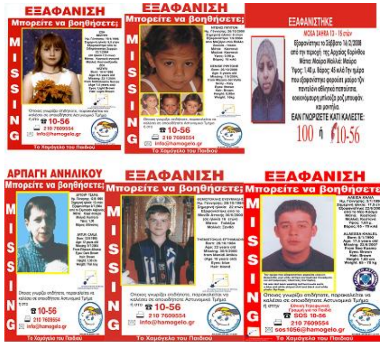
Fig. 1: Missing children ( http://www.hamogelo.gr )