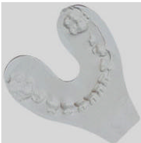
Fig. 4: Toothprints impression

dental characteristics unique to every individual. Not even identical twins have the same dental characteristics (Tesini et al. , 1999). It's very important to state that Toothprints bite impressions is ideal to be updated. So there is a recommended schedule in order to keep impressions useful: