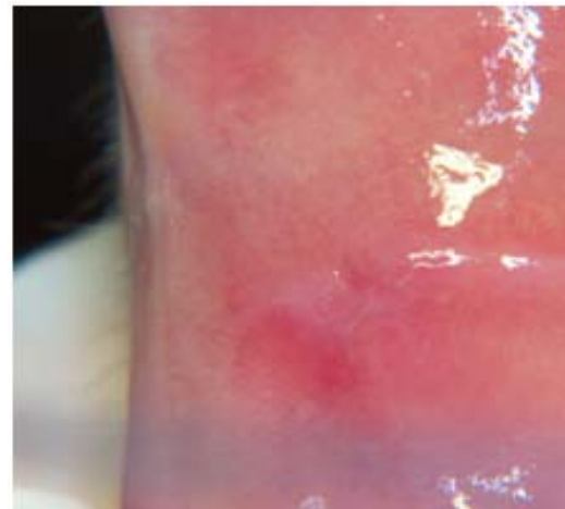
Fig. 5: About 10 days after the laser surgery the patient was recalled. The photograph shows the satisfactory healing