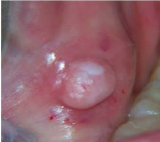
Fig. 1: The fibroma on the right buccal mucosa was referred as a dysfunction problem by the patient