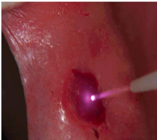
Fig. 2: The fiber-optic of diode laser applied on the lesion using specific pain-free parameters