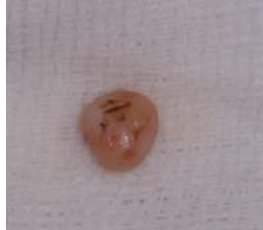
Fig. 4: The fibroma after the laser surgery removal