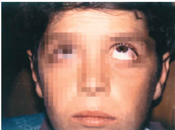
Fig. 1: Fracture of the area of the left ocular