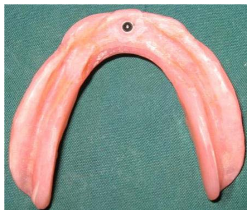
Fig. 2: Mandibular denture