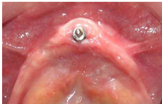
Fig. 1: The 6 months after surgery

Marginal bone loss was comparable to delay loading of implant and was 0.5 mm at 6 month, that was acceptable (Misch and Bidez, 2008). There were no signs of BOP and probe depth were not abnormal (3 mm). ISQ values were 70, 72, 75, 77 at the surgery, 1, 3, 6 months follow up, respectively (Fig. 1-3).