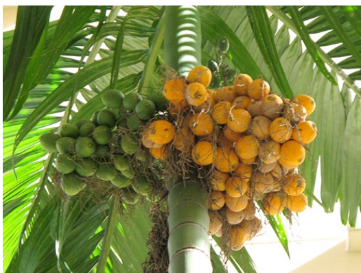
Fig. 2: Areca catechu Linn; http://floraofsingapore.wordpress.com