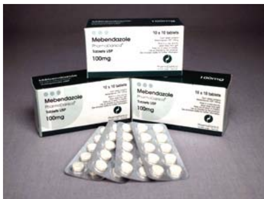
Fig. 3: Mebendazole; http://www.stanford.edu/class/humbiol103/ParaSites2006/Enterobius/