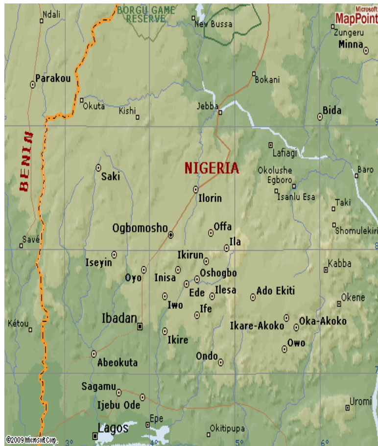
Fig. 1: The map of Southwestern Nigeria showing the various locations where animals were sampled

One hundred twenty samples of pigs were collected from four different locations of >100 km apart. Forty one CBP were from Obafemi Awolowo University (OAU), Teaching and Research Farm (T&R Farm), Osun State; these pigs had a history of >5 years crossbreeding between selected or introduced commercial exotic founder stocks that were contaminated with other breeds of pigs. The remaining three locations contained indigenous pigs. First, 30 NIP were from Ogbooro, Saki Oyo State. Local pigs kept in a mud house were released to roam about the village. This area was dominated by Muslims who do not rear or eat pigs; a few educated Christian families inherited the animals from their forefathers and this, to some extent, restricted infiltration by other breeds of pigs from the neighbouring states. Second, 16 NIP were from the Institute of Agricultural Research and Training (IAR&T), Ibadan, Oyo State. They were kept on a research farm and had regular feeding and record-keeping for each animal. Third, 33 pigs were from Igbara Odo, Ekiti State. These local pigs were allowed to roam about scavenging for survival and they had a history of being reared for over