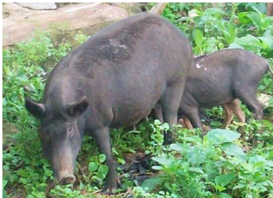
Fig. 3: A representative picture of Nigerian Indigenous Pigs (NIP)

distance between the external iliac tuberosities; Rump Length (RL): the distance between the end of ischion and the beginning of the rump (external iliac tuberosity); Rump Height (RH), the distance between the highest point of the hip bone and the ground; Length of Snout (LS), the distance between the frontal nasal suture and upper part of the snout; Breast Height (BH), the distance between the withers most sloping part and the sternum most curved part; Wither Height (WH), the distance between the highest part of wither and the ground; Body Length (BL), the distance from the point of the shoulder to the pin bone; Interorbital Width (IW), the shortest distance between the two eye sockets; Paunch Girth (PG), the length of the circumference of the pelvic region just in front of the hip; Heart Girth (HG), the length of the circumference immediately behind the front legs; Neck Circumference (NC), the length of the circumference of the neck; Ear Length (EL), the distance between the tip of the ear and the base; Hip Width (HW), the distance between the points of the hip (hindquarters); Shoulder Width (SW), the distance between the points of the shoulder; Tail Length (TL), the distance from the tip to the base of the tail; Live Weight (LW), the live animal body weight and the Teat Number (TN) that observed for the each animal sampled.