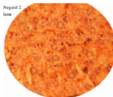
Fig. 2: Liver tissues of P. berghei infected mice

Administration of 800 mg/kg BW/day stem bark extract of G. parvifolia could reduce the degree of parasitemia and MDA level to a greater extent than those of P. berghei -infected mice. Histopathologic profile revealed that mice treated with 800 mg/kg BW/day stem bark extract of G. parvifolia had milder necrosis and less striking increase of Kupffer cells compared to mice not treated with the same extracts. Likewise, the activities of GOT and GPT enzymes decreased with increasing doses of the extract administered. The decline of parasitemia degree and MDA level as well as improvement in liver histopathology as observed in the group of mice treated