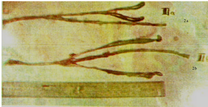
Fig. 2: (a, b) Abnormally deformed illeocaecal junction, caecal pouches and an anatomically normal illeocaecal junction and caecal pouches

The right oviduct develops as in the left oviduct from the Mullerian Ducts, until shortly after the end of the undifferentiating stage (end of the 6th day of incubation) when the left oviduct is longer than the right (Aitken and Johnson, 1963). In birds, the female embryo has a pair of undifferentiated gonads and the Mullerian ducts. However, during the course of differentiation of the female avian embryo, only the left ovary and the Mullerian duct develop whereas the right ovary and the Mullerian duct regress (Yonju et al. , 2004).