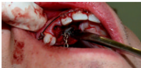
Fig. 3: The Opti-Mim ® bracket bonded on palatal tooth surface

thoroughly from the granulation tissue. To protect the area from hydration a ribbon gauze used between