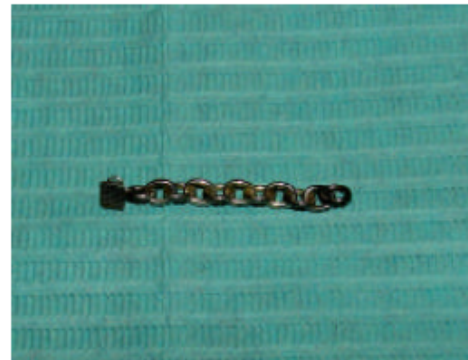
Fig. 4: The OptiMim ® direct bond eyelet with chain used for the traction of the impacted canine

thoroughly from the granulation tissue. To protect the area from hydration a ribbon gauze used between