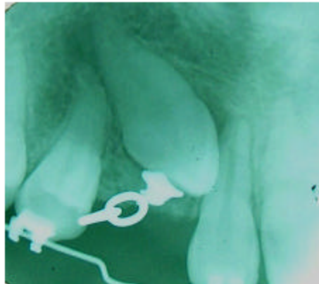
Fig. 6: At the follow up the coronal movement of the impacted canine assessed on periapical x-ray. The tooth is bulbous; a negative factor for rapid orthodontic traction

surface using primer activated orthodontic adhesive (Mono-lok2™, Rocky Mountain Orthodontics, USA). The end part of the chain, sutured on buccal vestibulum (3/0, polypropylene), but firstly passed through the incision line after flap closure and suturing of the edges (4/0 silk). The patient covered empirically with antibiotics (per os Amoxicillin 500 mg tds, 4/7). A small periapical x-ray revealed the correct location of the bracket and chain on the tooth surface (Fig 5). Three months later, at the follow up, another periapical x-ray showed the successive coronal movement of the impacted tooth in relation to the adjacent teeth (Fig 6).