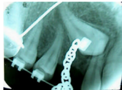
Fig. 5: Checking the bonding intraoperatively with periapical x-ray

the coronal part and the bone margin. The routine method of acid etching and bonding of the bracket performed on a dry surface which achieved using a single sterile plastic syringe. The bracket bonded on tooth