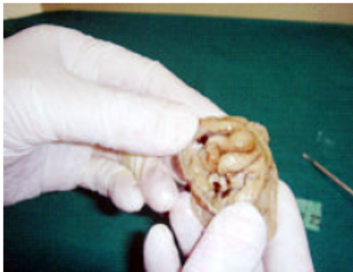
Fig 2: The internal lining of diverticulum is hyperplastic with rugae resembling gastric mucosa

Surgery was performed with a diagnosis of invagination and laparotomy revealed jejuno-jejunal invagination, which was reduced. A distended jejunal loop appeared, which was excised and end-to-end anastomosis was performed. Specimen was sent to the pathology department.