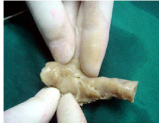
Fig 3: External view of specimen with no obvious protrusion and opening (already sectioned)