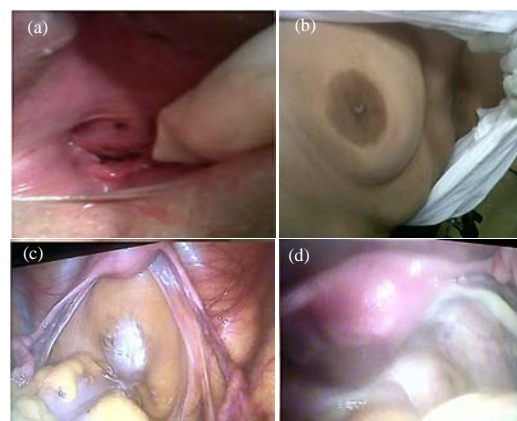
Fig. 2: Examination of secondary sexual characteristics (Stage 5)