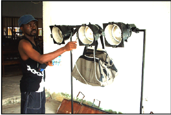
Plate 1: The researcher applying surface finishing to three studio/stage lights that he fabricated. A fabricated dimmer is housed in the bag, which enables the lights to be dimmed and brightened as required in the visual arts studio. This locally fabricated equipment, cost a small fraction of what the imported forms do. Besides, it is cheaper and easier to maintain the local technologies since foreign exchange is neither required to import parts/consumable nor to pay for expensive expatriate labour