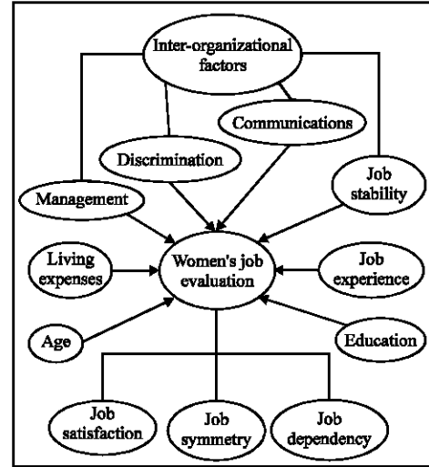
Fig. 1: Causal model of factors influencing women's job evaluation

The results of examining women's evaluation by three indexes of: job symmetry, job dependency and job satisfaction, are as follows: