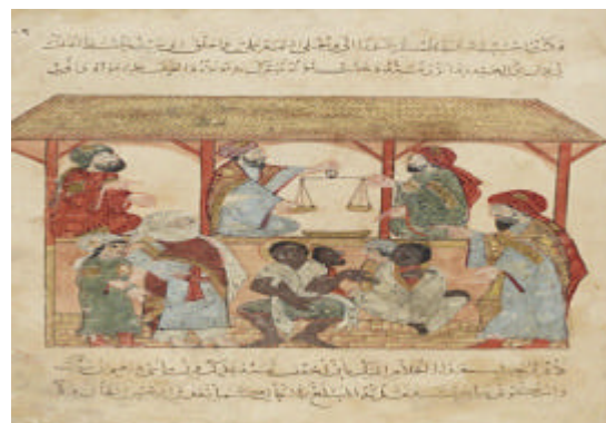
Fig. 5: Al-Harith in the slave market

Animals depicted quite realistic with dynamic movements. Other than the obvious differences in size, the animals compared to similar large animals that are larger in size. Dress with classic method is designed. Servants and slaves with short abba and at times with long shoes, braided hair are shown. There is not much success in drawing women and children.