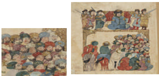
Fig. 8: Abu Zayd preaching, Left is part of the Figure 8

is different from others clothes depicted in the work. While, the groups of poets with clothes and different intakedepicted.