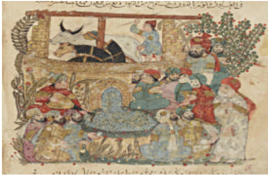
Fig 1: Abu Zayd and listeners