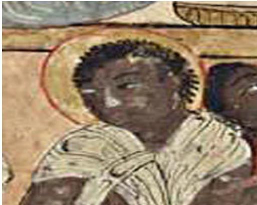
Fig. 6: Part of the Figure 5 salve with a halo around the head