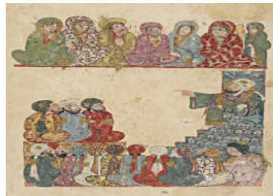
Fig. 4: Abu Zayd preaching

Images of this book are based on configuration, even if the text does not have such images; each icon is a character in the image accordingly. The figures placed in varied position. What draw your attention to the images of this version are hand and body gestures. Hand movements and body position all contribute in some way to transfer concept. Considerable flexibility in configuration can be seen that in the proportion of time is unprecedented. Artist's representation of the human figure and face occurred in perspective, silhouette, three-quarters and has even behind the image. Faces have expression states and internal states of the characters are visible for face. Footprints lack of attention to facial expressions can be found in the initial portrayal of Iran. The artist also pay special attention to the facial details; rather elongated nose and oval face covered with a black beard. The figures are thick and coarse; dark-colored was considered as one of the elements of Arabic art.