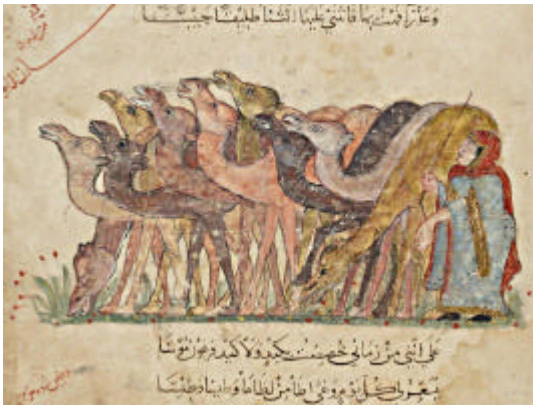
Fig. 2: Vocalist and camels