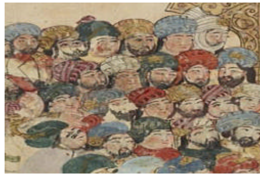
Fig. 10: Part of the figure 9

images on paper immediately prepared. "In some projects, such as the eastern islands (Fig. 7), a new combination, a new landscape can be seen and this scene must have at least one very important step in the development of landscape painting seen in Islamic art". Landscape is usually very simple and by drawing one or two tree is displayed. The role of trees is quite traditional and composition is such that people are trapped in the plains. Decorative elements such as palm leaves and pomegranate and pine tree adorn the pictures of the book that is common in schools of Baghdad.