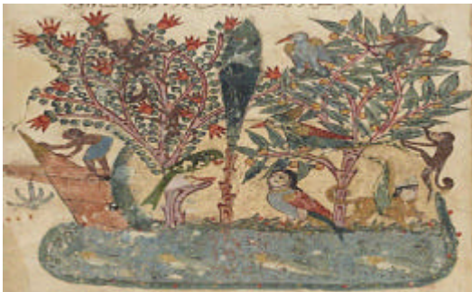
Fig. 7: The Mysterious Island