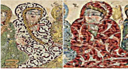
Fig. 11: Part of the figure 8, Compare with Figure 9