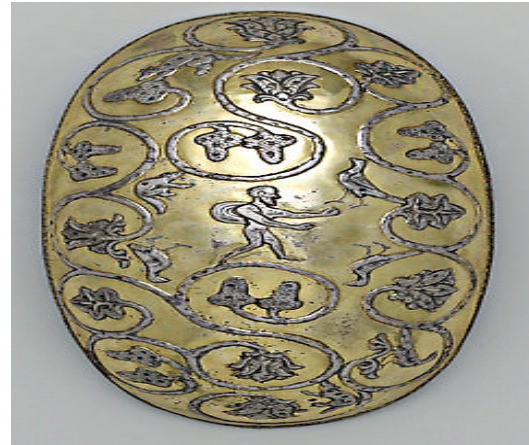
Fig. 13: a Manichean picture of Picture Books

Architectural space, external and internal and synchronization of the two is derived from Iranian art. Natural environments, such as a simple Manichean art have been working and little attention pay into