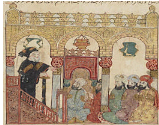
Fig. 3: Abu Zayd preaching in Samarkand

Images of this book are based on configuration, even if the text does not have such images; each icon is a character in the image accordingly. The figures placed in varied position. What draw your attention to the images of this version are hand and body gestures. Hand movements and body position all contribute in some way to transfer concept. Considerable flexibility in configuration can be seen that in the proportion of time is unprecedented. Artist's representation of the human figure and face occurred in perspective, silhouette, three-quarters and has even behind the image. Faces have expression states and internal states of the characters are visible for face. Footprints lack of attention to facial expressions can be found in the initial portrayal of Iran. The artist also pay special attention to the facial details; rather elongated nose and oval face covered with a black beard. The figures are thick and coarse; dark-colored was considered as one of the elements of Arabic art.