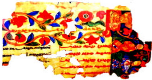
Fig. 12: Part of Figure 4 Compare with Figure 10, 13 and 14

scrolls inhabited by birds and animals, 6-7th century activities of the character but in the Byzantine and Iranian miniatures paintings were common.